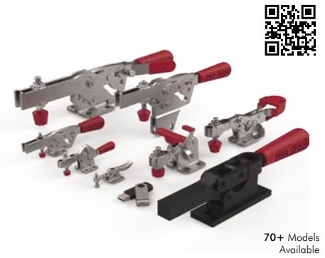
Push Action Clamps