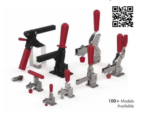
Horizontal Hold Down Clamps