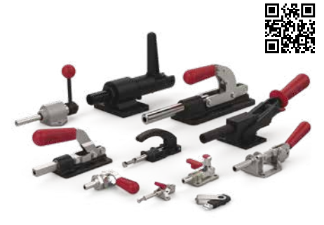
70+ Models Available