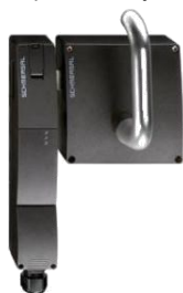
AZM200 with door handle

We offer a wide range of safety locks, door handle assemblies, and safety sensors, with special mounting brackets which can be integrated into the guards for a complete safety solution.