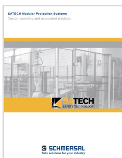
SATECH Guarding Systems Catalog, 36 pages