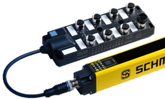
Muting sensor connection unit