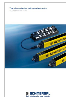
SLC440/445 Brochure, 10 pages