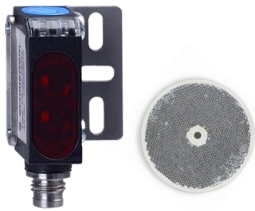
Reflective muting sensor