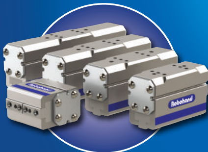
G110-25M 25mm Cylinder Bore