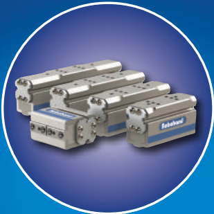
G110-08M 8mm Cylinder Bore