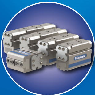
G110-11M 11mm Cylinder Bore