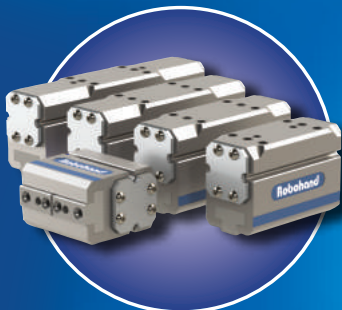
G110-18M 18mm Cylinder Bore