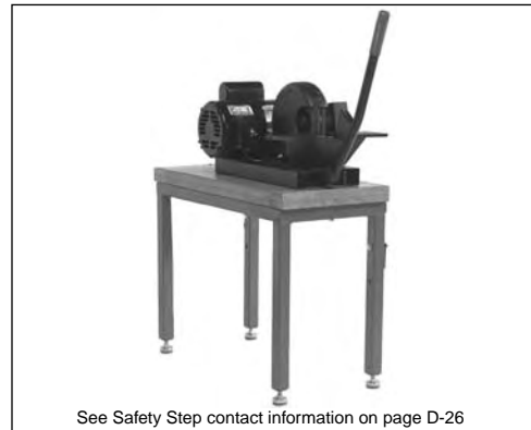
See Safety Step contact information on page D-26