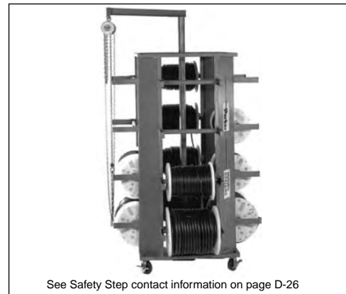
See Safety Step contact information on page D-26

Height - 104" (120" with optional overhead crane) Width - 67" Length - 67"