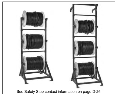
See Safety Step contact information on page D-26

Height - 59" (82-1/2" with 4th reel option) Width - 27-3/4" Length - 27-1/2"