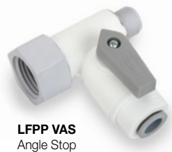
LFPP VAS Angle Stop

A full range of LIQUIfit ball valves are available. For specifications and configurations please consult master catalog 3501E.