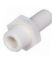
6521 Stem Adapter