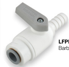
LFPP VUCPB Barbed x Tube