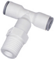
6508 Swivel Branch Tee