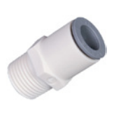
6505 Male Connector