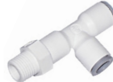
6503 Swivel Run-Tee