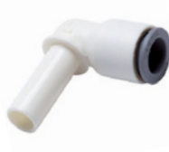
6382 Plug-in Elbow