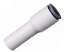
6366 Tube Reducer