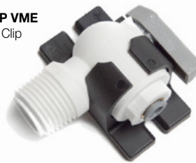
LFPP VME with Clip