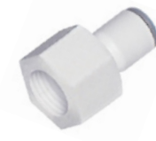
6315 Female Connector