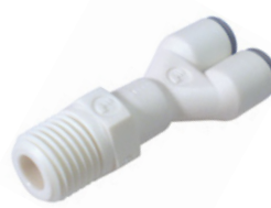
6548 Swivel Y Connector