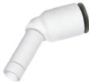
6380 Plug-in 45 Elbow