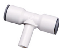
6388 Plug-in-Branch Tee