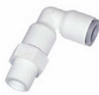
6509 Swivel Elbow