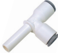
6383 Plug-in Run Tee