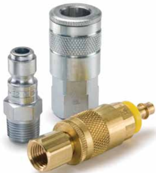
Performance 10 Series (1/4", 3/8", 1/2" sizes)