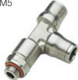
171PLM Male Run Tee Tube To Tube to BSPP or M5