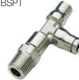
171PLM Male Run Tee Metric Tube To Tube to BSPT