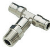
172PLM Male Branch Tee Inch Tube to NPT to tube