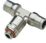
172PLM Male Branch Tee Tube to BSPP or M5