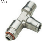
171PLM Male Run Tee Tube To Tube to BSPP or M5