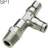
171PLM Male Run Tee Metric Tube To Tube to BSPT