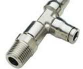
171PLM Male Run Tee Inch Tube to Tube to NPT, UNF