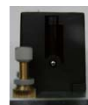
OFF (Pulse blow)