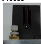
ON (Continuous blow)