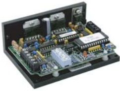
OFS350-DRI Open-Frame Stepper Drive

The OFS350-DRI is a microstepping driver that is operated with an external step and direction controller. A power supply, step motor, and step and direction controller are required in addition to the OFS350-DRI. These system elements are shown below.