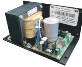
STP-32PRK4 Power Supply