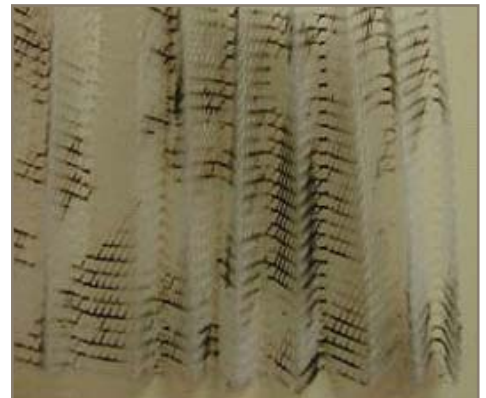
Burnt polymer pleat support mesh from arcing

Varnish is attracted to metal surfaces, this results in an overall decrease in productivity.