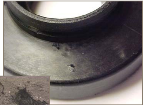
Pitting on filter end-cap

Micro-glass to less efficient Cellulose filter media and also to decrease flow density by operating duplexing filter changeover valves in the center position. Parker Static Control filter elements eliminate these compromises and ensure proper system filtration performance.