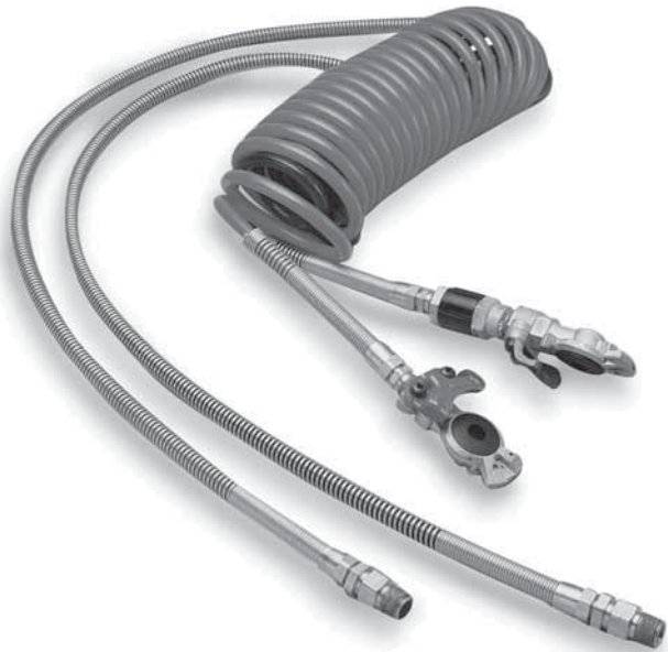
Note: Gladhands not supplied.

For information on additional truck and trailer products, call or write for the Parker Fleet Products Catalog 4453.