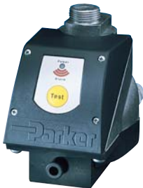
ZLD-10 Zero Loss Drain Temp: 35°-140°F (2°-60°C) Pressure: 12-250 PSIG (0-17 bar)