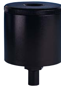
MS-50 Metal Sump Drain (External) Temp: 175°F (79°C) Pressure: 250 PSIG (17 bar) 1/8" NPT Drain Connection 1/2" NPT Inlet Connection