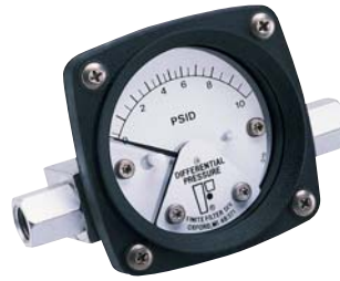
DPI-25 Differential Pressure Gauge Temp: 200°F (88°C) Pressure: 5000 PSIG (340 bar) 1/4" NPT Connections