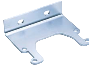
BK-1, BK-3 Mounting Brackets