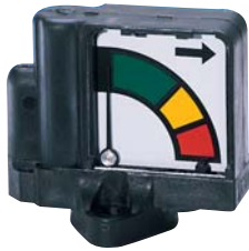
DPG-15 Differential Pressure Gauge Temp: 175°F (79°C) Pressure: 500 PSIG (34 bar) (Fits on pre-drilled H-Series housings only)