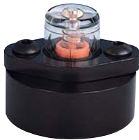
DPI-13 Differential Pressure Indicator Temp: 175°F (79°C) Pressure: 250 PSIG (17 bar) 1/8" NPT Connections