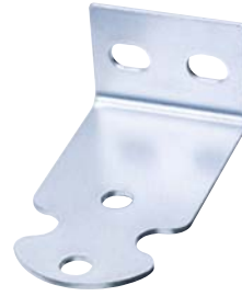
MBS-1 Stainless Steel Mounting Bracket