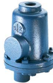
ADT-50 Float Actuated Drain Trap Temp: 450°F (232°C) Pressure: 150 PSIG (10 bar) 1/2" NPT Inlet Connection 1/4" NPT Drain Connection