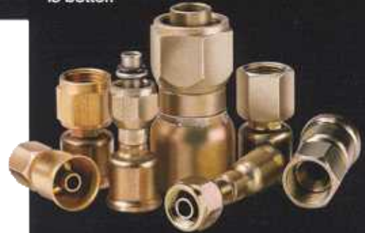
All Parker steel fittings feature a durable, corrosion-resistant zinc plating.

Parker 26 Series fittings feature over 25 different end configurations. So no matter where you need to go, 26 Series fittings will get you there. Plus, they can be used on virtually all 100R5 type hoses. Simpler really is better.