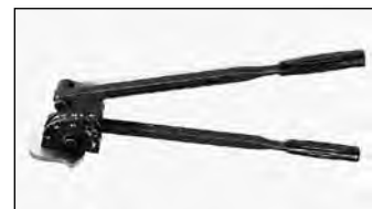
Fig. R1 — Medium Duty Inch Hand Tube Bender