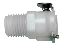
Typical shown: 1/4" NPT Male Pipe Thread with Shut-off Valve

These adapters are available with or without an integral shut-off valve. The shut-off valve will stop line flow when the adapter is removed from the unit. Flow resumes when connected.