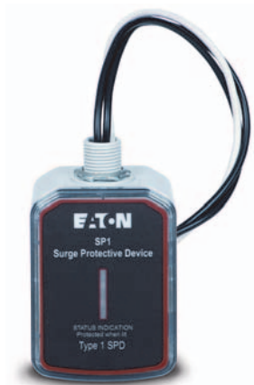
SP1 Surge Protective Device