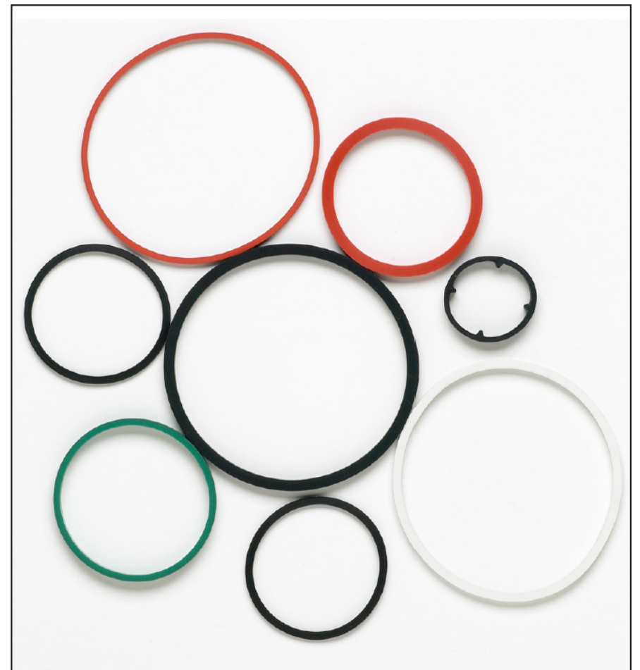
Lathe cut seals in various sizes, cross-sections, and colors