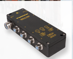
Junction Box Wiring Consolidation