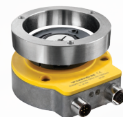
Rotary Position Dump Position