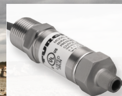
Pressure Transducer Monitor Hydraulic System