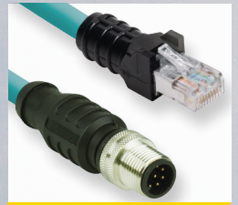
Ethernet Connection Communication