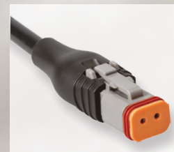
Deutsch Connectivity Lighting