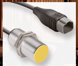
Inductive Sensor Tone Wheel/Speed