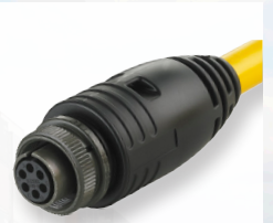
Mil-Spec Connectivity Power & Communication