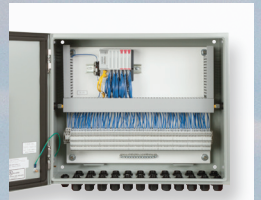
TEPS Load Tracking