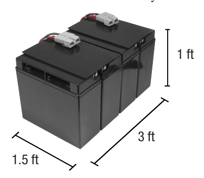
(The image above is only illustrative, not representative of the actual application.)

Automotive lithium-ion battery enclosure.